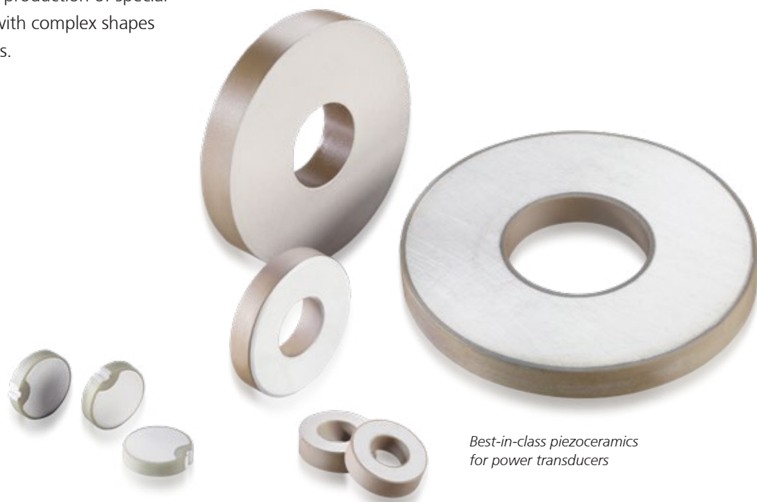
Best-in-class piezoceramics for power transducers