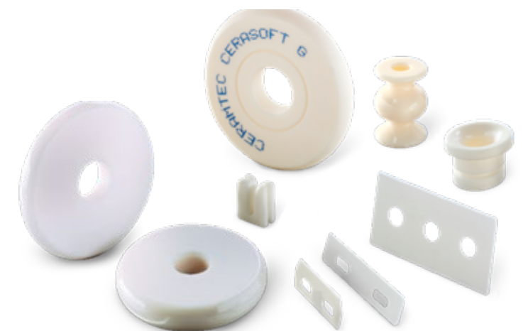
Exemplary products for textile machinery applications

With its extensive material range and continuously growing production expertise in the field of ceramic components for textile processing, CeramTec offers a comprehensive line of products for textile producers and textile machinery manufacturers such as friction discs, thread guides, navels and cutters.