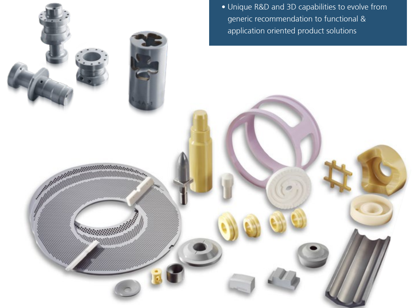
Exemplary custom specific products