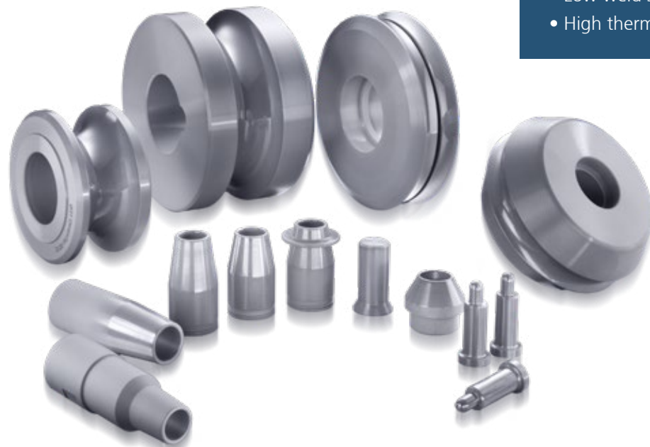
Exemplary products for welding technology